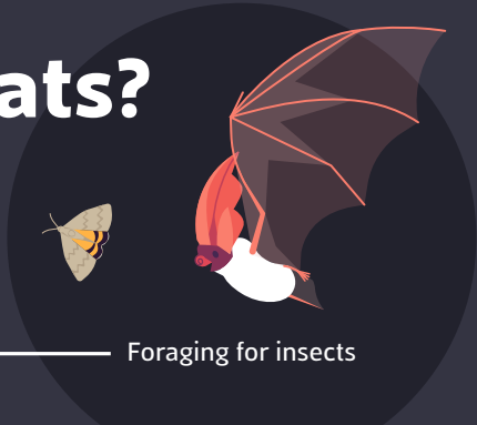
Foraging for insects

Below you will see examples of these natural features. The species illustrated provide a visual aid into how these features are used and not the sole species to use that feature.