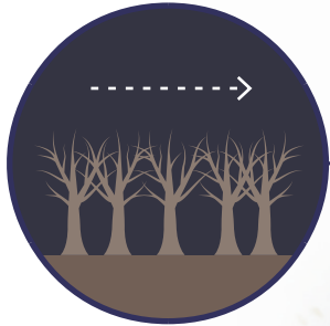
As a navigational aid especially when trees are in lines or hedges