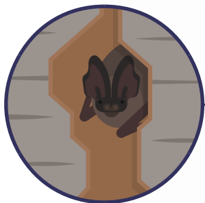
Roosting behind loose bark