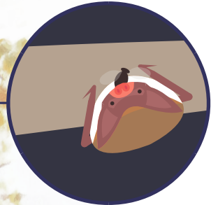
Feeding perch or protection during bad weather