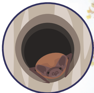
Roosting inside woodpecker holes