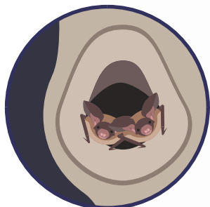
Roosting in rot holes