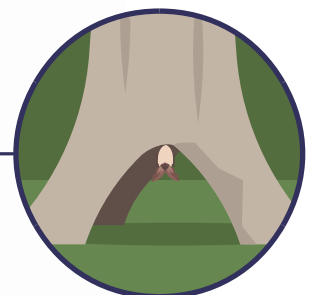
Winter hibernation in hollow trunk if frost-free