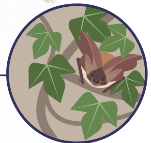
Occasionally roosting behind dense ivy