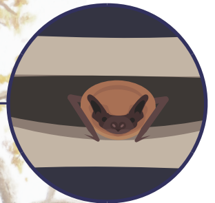
Roosting in cracks, splits and crevices