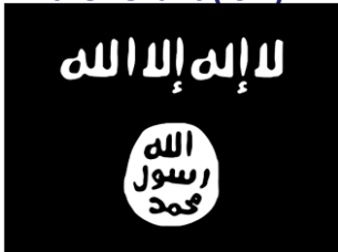
Islamic State of Iraq and the Levant (ISIL)

*Proscribed Organisation* ISIL was proscribed in June 2014 1,10 . ISIL is a brutal Sunni Islamist terrorist group active in Iraq and Syria. The group adheres to a global jihadist ideology, following an extreme interpretation of Islam, which is anti-Western and promotes sectarian violence. ISIL aims to establish an Islamic State governed by Sharia law in the region and impose their rule on people by using violence and extortion.