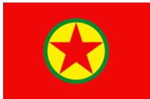
The Kurdistan Worker's Party (Partiya Karkeren Kurdistanî; PKK)

*Proscribed Organisation* The Kurdistan Worker's Party (PKK) was proscribed in March 2001 1 . Partiya Karkeren Kurdistanî (PKK), which translates as the Kurdistan Worker's Party, is primarily a separatist movement that seeks an independent Kurdish state in southeast Turkey. The PKK changed its name to KADEK and then to Kongra Gele Kurdistan, although the PKK acronym is still used by parts of the movement.