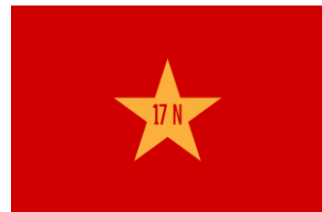
17 November Revolutionary Organisation (N17)

*Proscribed Organisation* N17 was proscribed in March 2001 1 . Aims to highlight and protest at what it deems to be imperialist and corrupt actions, using violence. Formed in 1974 to oppose the Greek military Junta, its stance was initially anti-Junta and anti-US, which it blamed for supporting the Junta.