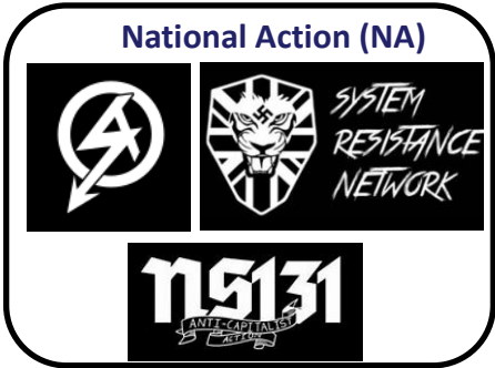
National Action (NA)

*Proscribed Organisation* National Action (NA) was proscribed in December 2016 2 . NA is a racist neo-Nazi group that was established in 2013 and has branches across the UK. NA expressed anti-Islamic, anti-Semitic, anti-BAME and anti-LGBTQ+ grievance narratives whilst also targeting establishment figures such as Members of Parliament (MP) and police officers 1 .