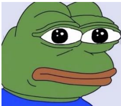
Pepe the Frog

Pepe the Frog is a popular internet cartoon character appropriated by the white supremacist movement and used in a variety of contexts; including in racist and antisemitic memes 4 .