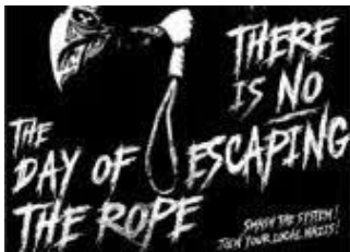
Day of the Rope (DOTR)

' Day of the Rope ' is a white supremacist concept taken from The Turner Diaries - a book depicting a fictional white supremacist revolution written in 1978 by neo-Nazi leader William Pierce (using the pseudonym Andrew Macdonald).