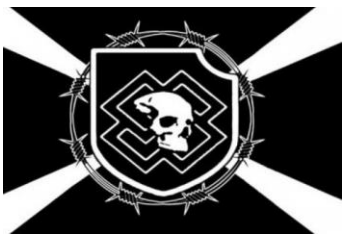
Feuerkrieg Division (FKD)

*Proscribed Organisation* FKD was proscribed in July 2020 1 .