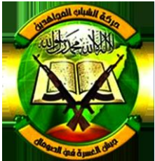
Al Shabaab (AS)

*Proscribed Organisation* Al Shabaab (AS) was proscribed in March 2010 1,9 . Organisation based in Somalia which has waged a violent campaign against the Somali Transitional Federal government and African Union peacekeeping forces since 2007, employing a range of terrorist tactics including suicide bombings, indiscriminate attacks and assassinations–With the principal aim of establishing of a fundamentalist Islamic state in Somalia.