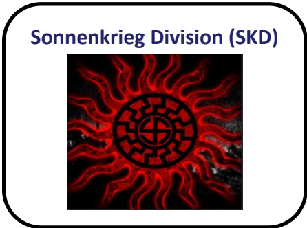
Sonnenkrieg Division (SKD)

AWD celebrates a collection of essays which advocate the use of violence in order to bring about a fascist, white ethno-state by initiating the collapse of modern society by means of a 'race war'. This ideology has become known as 'accelerationism'.