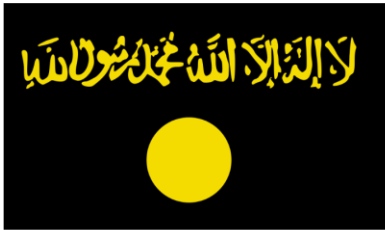
Al Qa'ida (AQ)

*Proscribed Organisation* Al Qa'ida (AQ) was proscribed in March 2001 1 . Originally inspired and led by Usama Bin Laden, its aims are the expulsion of Western forces from Saudi Arabia, the destruction of Israel and the end of Western influence in the Muslim world.