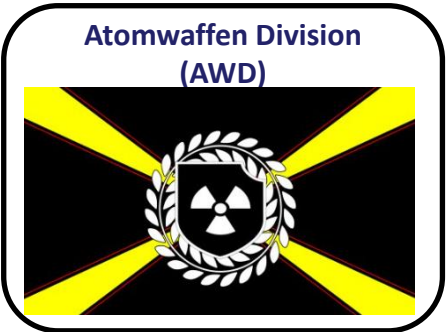
Atomwaffen Division (AWD)

In September 2017 NS131 (National Socialist Anti-Capitalist Action) and System Resistance Network (SRN) were included in the proscription as alternative names for NA 3 .